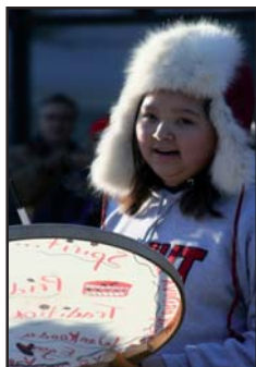
Reyna Villa/Eyak Echo