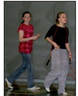
Reyna Villa/Eyak Echo