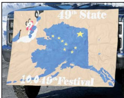
Reyna Villa/Eyak Echo