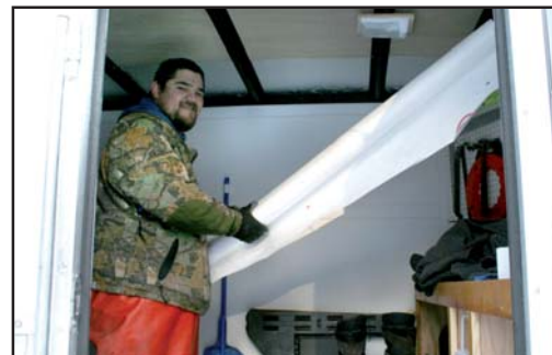
Reyna Villa/Eyak Echo