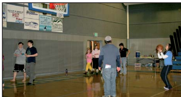
Reyna Villa/Eyak Echo