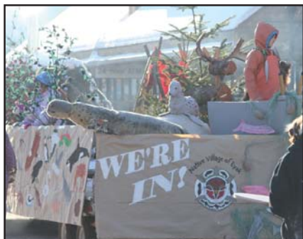
Reyna Villa/Eyak Echo