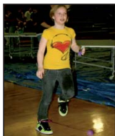
Reyna Villa/Eyak Echo