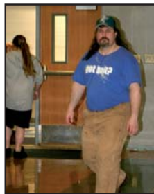
Reyna Villa/Eyak Echo