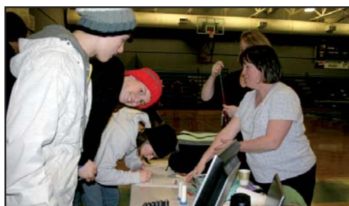
Reyna Villa/Eyak Echo