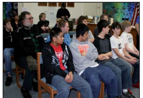
Reyna Villa/Eyak Echo