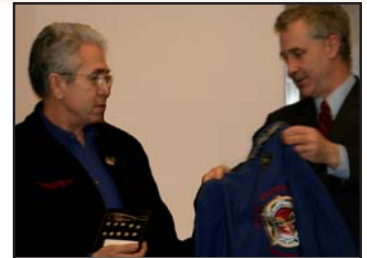
Reyna Villa/Eyak Echo