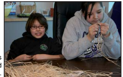
Reyna Villa/Eyak Echo