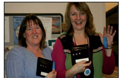
Reyna Villa/Eyak Echo