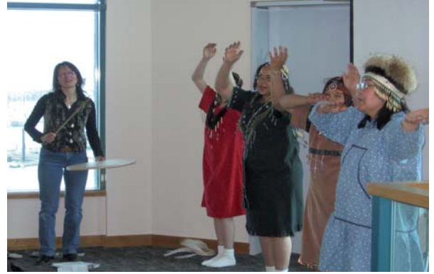
Above: The Cordova Alutiiq Ikumat Dancers in performance.

Without the collaborative efforts of the staff, tribal members, elders, community, visitors, friends, family, and volunteers, the Ilanka Cultural Center would not have been able to have such a wonderful year.