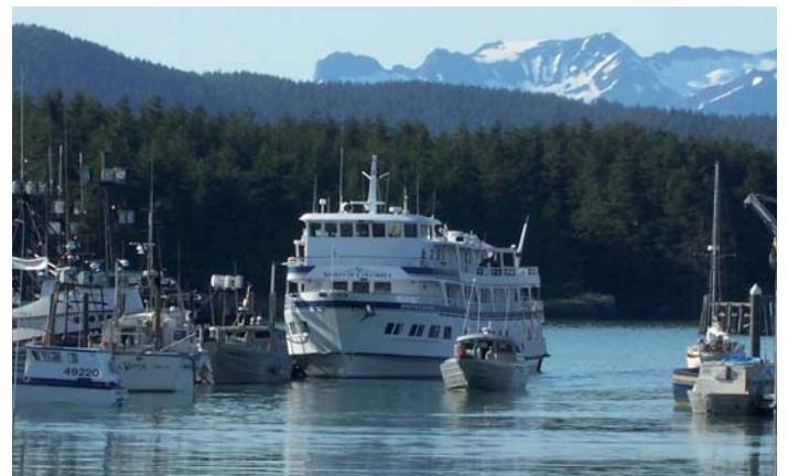
One of Cruise West's smaller ships, the Spirit of Columbia enters the Cordova city harbor.