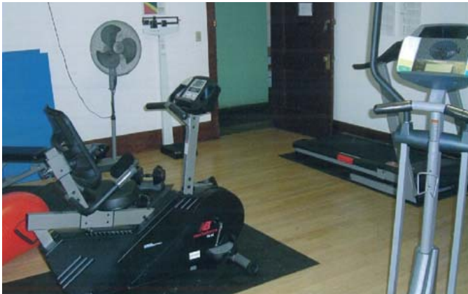
Check out NVE's state-of-the-art exercise equipment in the front room at the Masonic Hall.

Just a reminder- we have diabetic diet/low calorie cookbooks of all kinds available in our cookbook library at the NVE main office for anyone interested in trying new recipes that fit into their nutrition/weight loss program. Just come in and check them out!