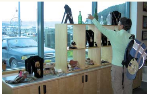
Visitors peruse the gift shop and museum.